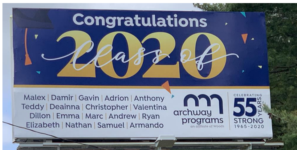
The billboard is located on the White Horse Pike in Berlin, right across from Lucien's Manor.

After the drive-through graduation ceremonies, many families drove to a billboard a few miles from the main campus that Archway Programs had produced in honor of the Class of 2020. The first names of the students are all listed on the billboard for everyone to see. This is another way Archway Programs is recognizing its graduates this year amidst the pandemic.