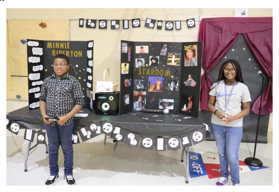
Proud Upper School students ready to present their project to Archway staff and their peers.

their class bulletin boards with interesting facts regarding their assigned person. They continued to learn more about these important historical characters cumulating with a presentation from all twenty classrooms in the Upper School gymnasium.