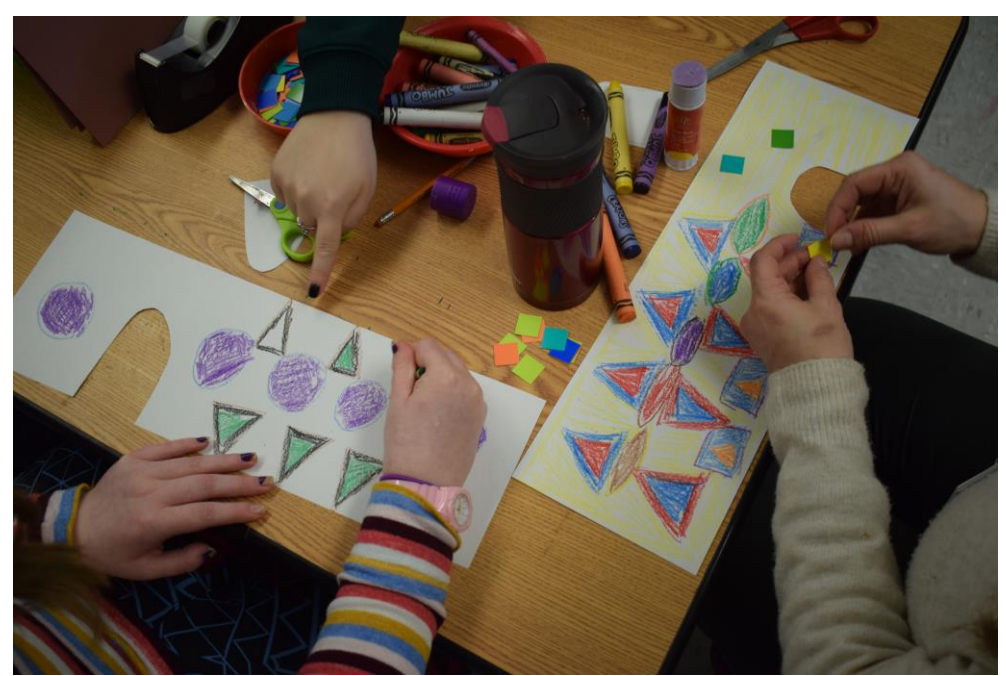
Archway Lower School students designed African huts using geometric designs that they created.

Students from each of the classrooms at the Archway Upper School were assigned an African American who made important contributions or was involved in important events from American history. Students decorated