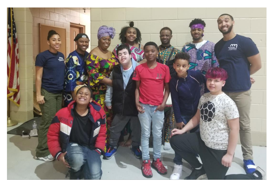
Members of the Universal African Dance and Drum Ensemble visited with Archway students and staff after their performance.

The world renowned Universal African Dance and Drum Ensemble visited Archway's main campus on February 27<sup>th</sup>, 2020 and performed at the Archway Upper School in Evesham, New Jersey. Administrative staff, school staff and students from the Upper School, Lower School and Cooper's Poynt gathered together for a phenomenal performance in the Upper School gymnasium. This is an event that Archway students look forward to each year, as part of the Archway Schools' Black History Month celebration. This year, students and staff from the Archway School at Cooper's Poynt traveled from Camden, New Jersey to join their peers for this year's performance.