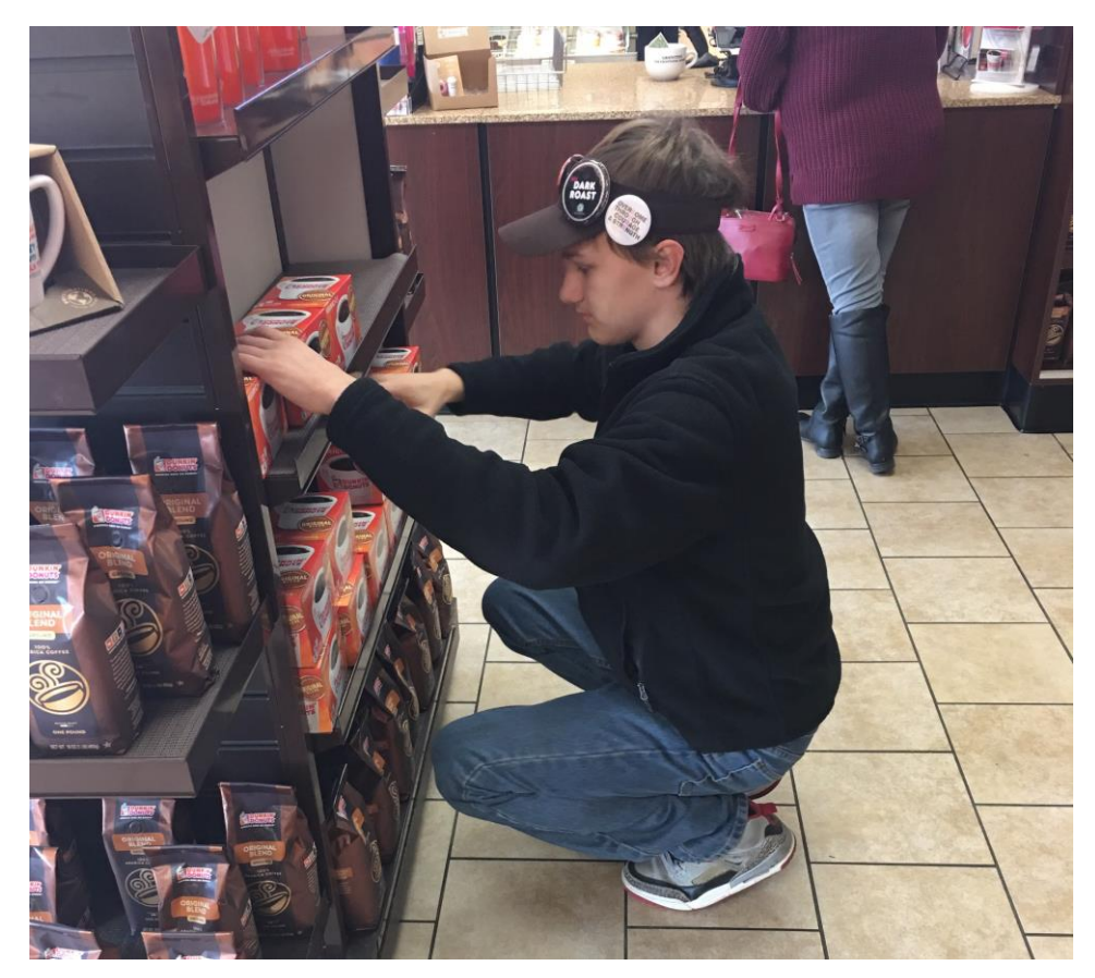
One of Archway's Upper School students working at Dunkin Donuts, their off-campus job, through the Career Education Program.