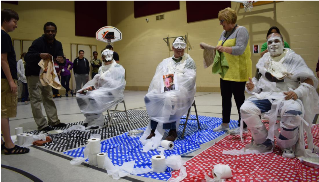
Archway's Lower School students as they pie their teachers in the face after reaching their fundraising goal!