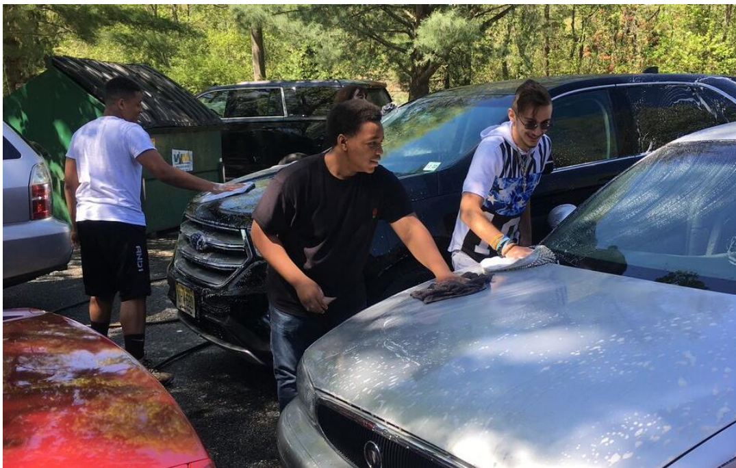
Students hard at work at the 'Car Wash for A Cause' event supporting the Pennies for Patients fundraiser.